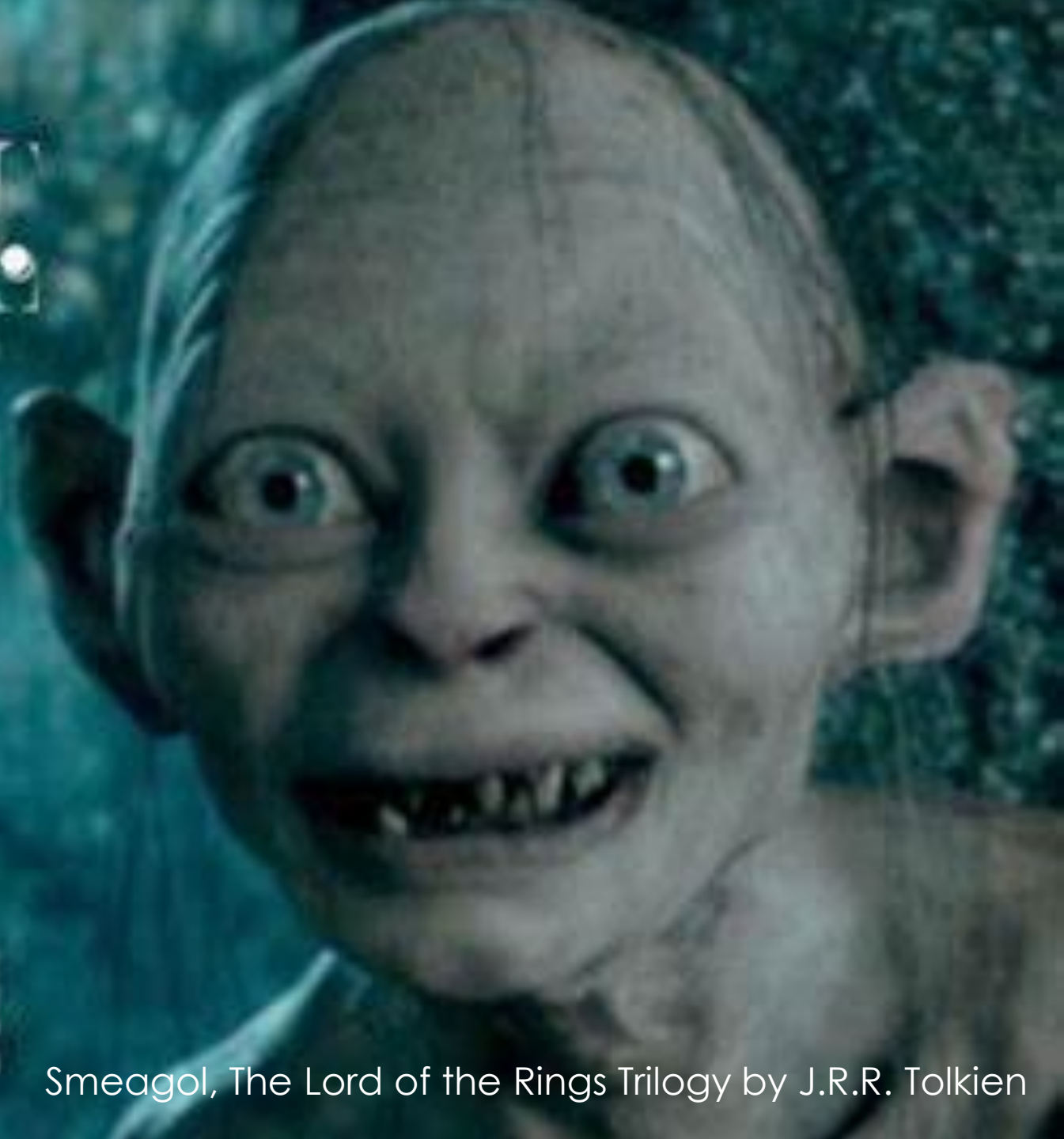
Smeagol, The Lord of the Rings Trilogy by J.R.R. Tolkien